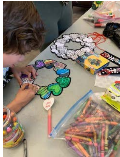
Santa Maria's Righetti ASTRA Club held a Valentine Service Project at Orcutt Library. There was a full house of sweethearts who also went home with bookmarks, heart wreaths, candy glow sticks.