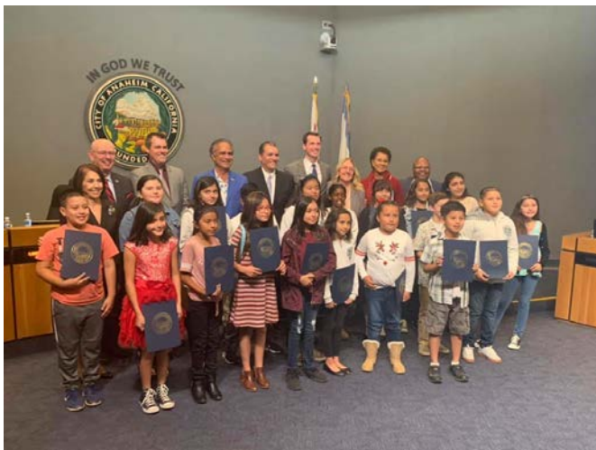
Altrusa Anaheim sponsors a Creative Writing Project honored by the Anaheim City Council.