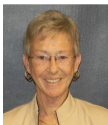
Altrusa International of Centre County, Pennsylvania District Two director3@altrusa.org