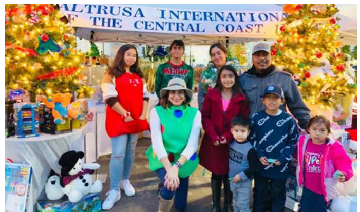
Altrusa of Central Coast Christmas Tree Event.