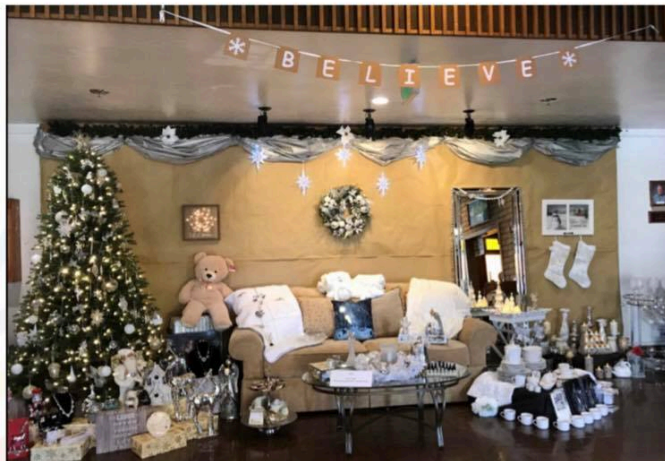
This Year's Altrusa Tree for the Extravaganza. Thanks to all who contributed!!

EXTRAVAGANZA – Great Night – Raised even More money than last year! Congrats!!!!