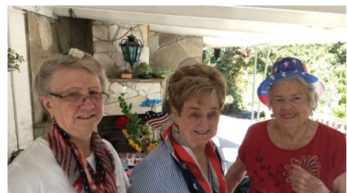
Atrusans of Glendale enjoyed their summer social.