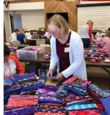
Chula Vista members working on Days for Girls.