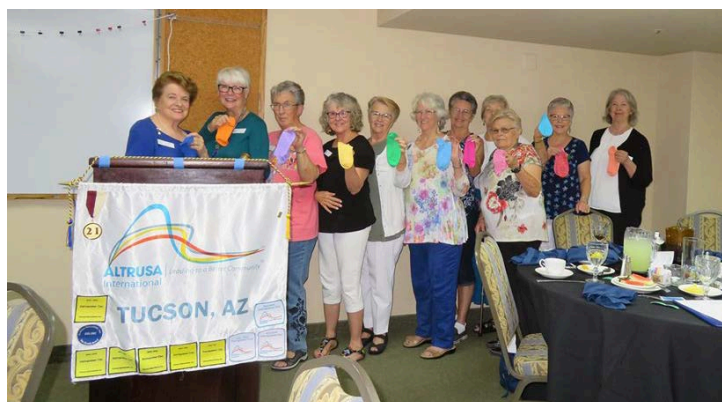
Socks guide the Tucson officers on the best path.