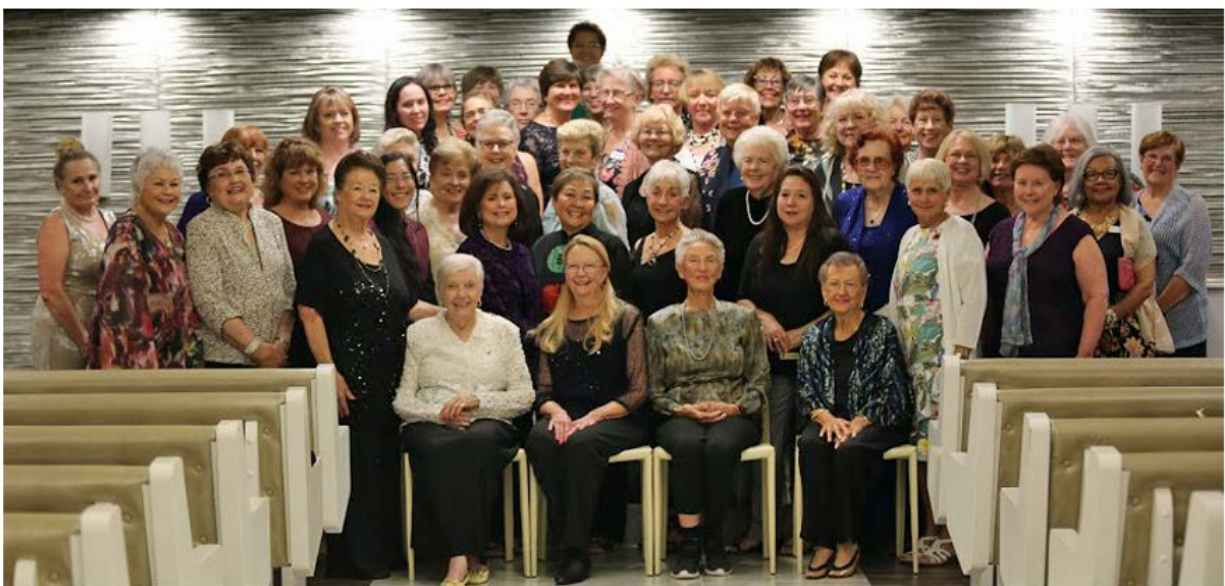
District Eleven Attendees at Altrusa International Convention – Reno, CA – July 2019