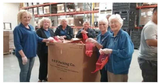
San Diego hosted a "Harvest Party for the children at Ronald McDonald House with craft activities and a Project Linus Blanket give-away. They also bagged produce at the San Diego Food Bank for Make a Difference Day.